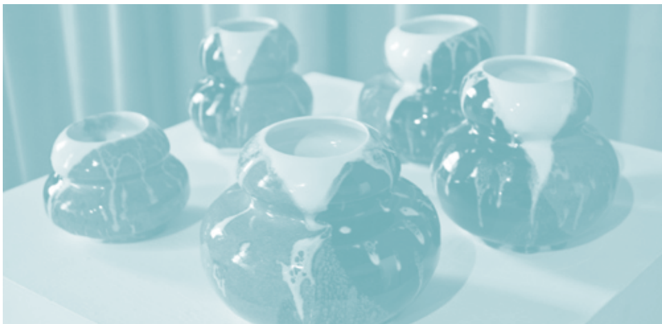
Artwork Credit: Sara Clark, Summer Studio student 2011

This class focuses on fashion illustration with a concentration in garment construction. Students learn the importance of basic fashion illustration in the industry. Learning to think with a pencil will become a habit of mind for students attending this studio. Students develop skills in pattern making, fabric selection, draping and garment construction. The final project is the creation of a piece to be exhibited at the conclusion of the program.