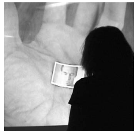
Viewing Acoustic Reflections , an installation by Mike Wiggins, MFA Design, 2003