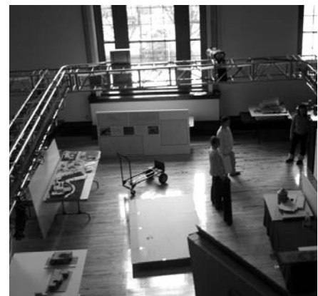
Architecture Reviews, Pozen Theater